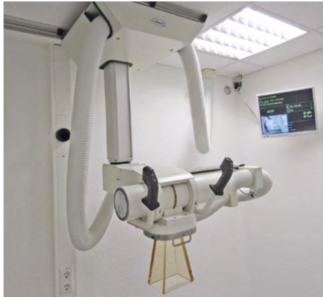
<< T-160 with ceiling suspension allows optimal treatment settings

The powerful 160 kV unit provides high dose rates for the semi-deep therapy. The choice of „soft“ spectra for the superficial x-ray treatment is possible.