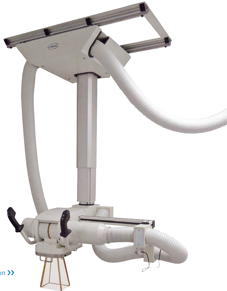
T-160 ceiling suspension >>